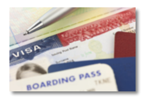
About J-1 Visa

Detail please see the application procedure.