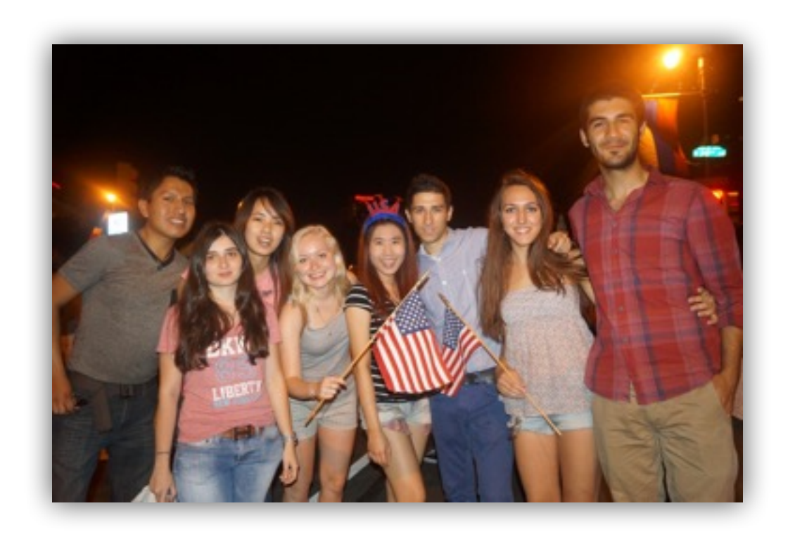
About the Internship/Traineeship...